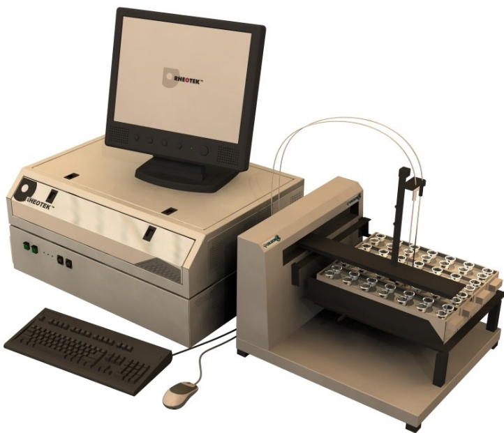
Autosampler can be accommodated on top or to one side.