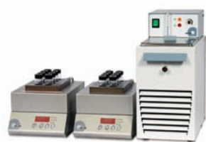
Sample heating and cooling

High precision allows tighter control of a polymer process, providing large potential savings for the resin manufacturer or processing plant.